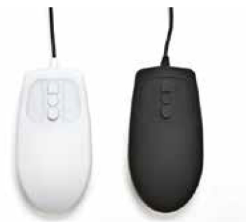
MIGHTY MOUSE Washable Silicone