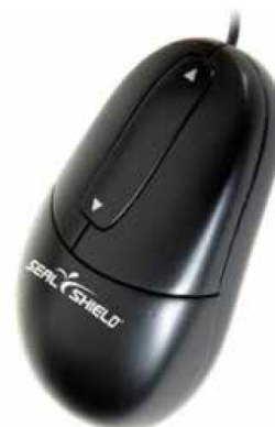
VALUE LINE MICE Washable