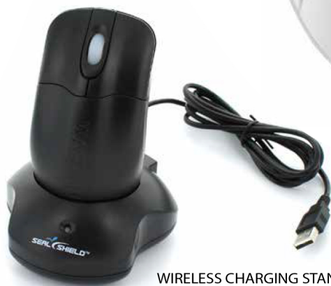
WIRELESS CHARGING STAND