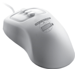
PETITE MOUSE Medical Grade