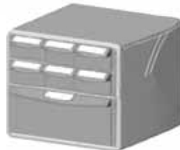
MODULAR DESIGN Build the perfect design to fit your workflow