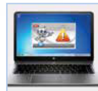
MANAGEMENT TOOLS Allows trackability of cart usage and maintenance