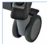
RUGGED CASTERS Makes mobility much easier