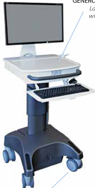
GENEROUS WORK SURFACE Large workspace with raised edges