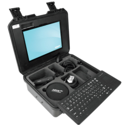
Compact Rugged Telemedicine Kit