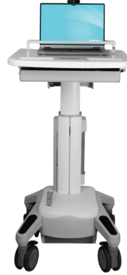
TeleCore notebook cart