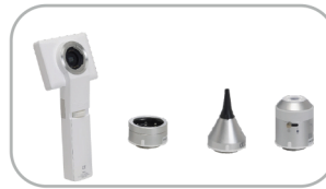
Multi-purpose Exam Camera With General Viewing, Otoscope, & Dermoscope Lenses