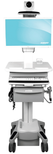
TeleCore LCD cart