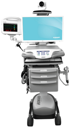
TeleCare with accessories