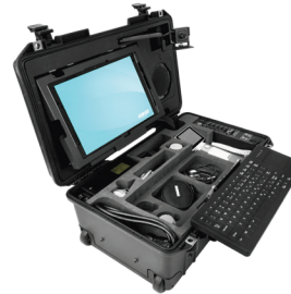
Medium Rugged Telemedicine Kit