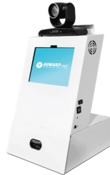
Customized A1 Telehealth Kiosk