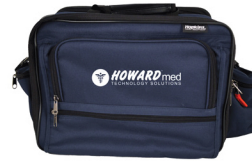
Shoulder Bag Soft Telemedicine Kit