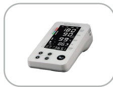
Spot VSM with BP, Temp, and SpO2 (requires storage)