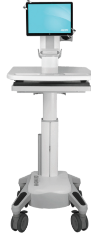
TeleCore tablet cart