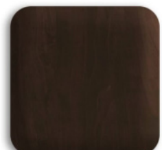
Chocolate Pear Tree