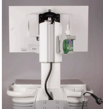
Hand Sanitizer (Small)