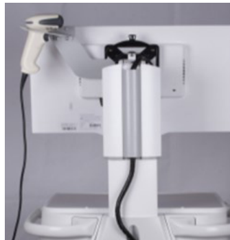
Tethered Scanner Mount