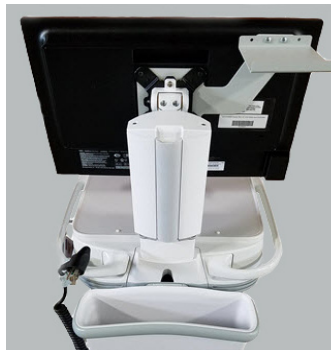
Zebra Label Printer Bracket