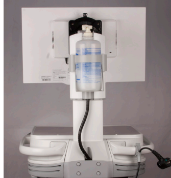
Hand Sanitizer (Large)