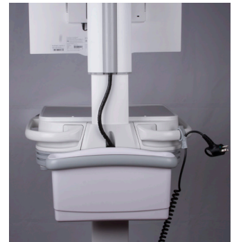
Basket with Rear Handle