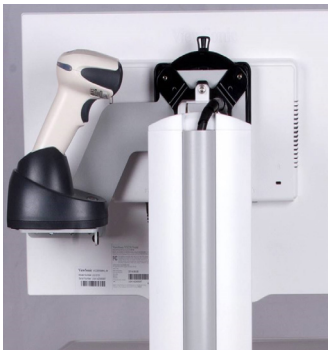
Wireless Scanner Mount

Howard Medical offers many accessories to facilitate efficiency for healthcare professionals. Multiple mounting options are available for the right mix and best location. Many other choices available to customize your cart to meet your workflow needs. See your Convergint Sales Representative for details or a demonstration.