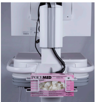
Glove Box Holder