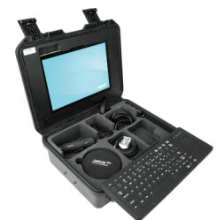
Compact Rugged Telemedicine Kit