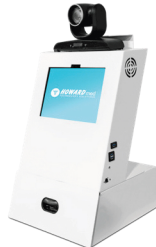
Customized A1 Telehealth Kiosk