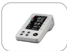
Spot VSM with BP, Temp, and SpO2 (requires storage)