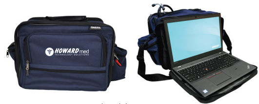
Shoulder Bag Soft Telemedicine Kit