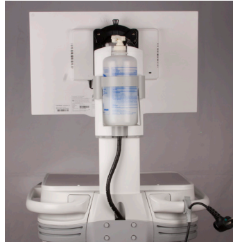
Hand Sanitizer (Large)