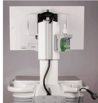
Hand Sanitizer (Small)