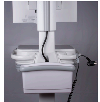
Basket with Rear Handle