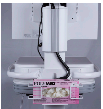
Glove Box Holder